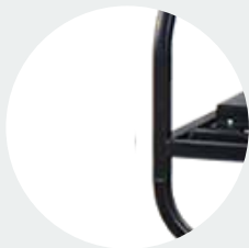
Rugged low-profile frame

Specifications and details are subject to change without prior notice.